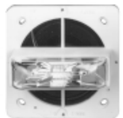
SERIES E70 Speaker Strobe Mounting Plate