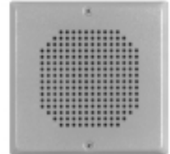
SERIES E70 Speaker