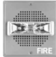
SERIES E70 Speaker Strobe

Series E70 Multi-Candela Speaker Strobes are UL Listed for indoor use, wall mount, under Standard 1971 (Signaling Devices for the Hearing-Impaired) and Standard 1480 (Speaker Appliances). All inputs are supervised and employ IN/OUT wiring terminals for fast installation using # 12 to # 18 AWG wiring.