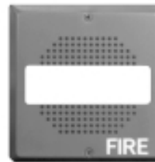
SERIES E70 Strobe Cover Plate